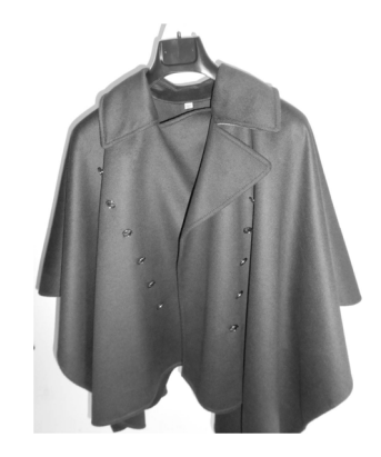
Figure 1. The object of the study, a garment 60% wool and 40% cashmere.

The functional unit of the study is one knitted garment in a soft blend of wool and cashmere (60% wool and 40% cashmere). The flow unit for the LCA consists of 495 capes. The whole manufacturing process of the order of the garment (495 pieces) was carried out from August 2016 to October 2016. This garment was randomly chosen by the authors in order to represent a typical production of the company. It has the function of protecting the body against cold in winter and at the same time, with its elegance it has an aesthetic value (Figure 1). The product analysed, contains characteristics common to almost all products manufactured within the San Lorenzo Group and it includes all products manufactured within the San Lorenzo Group. Raw materials (fabrics and accessories) are the only elements that differentiate one garment from another.